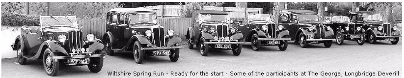
Wiltshire Spring Run - Ready for the start - Some of the participants at The George, Longbridge Deverill